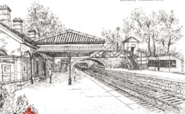
Malahide Railway station