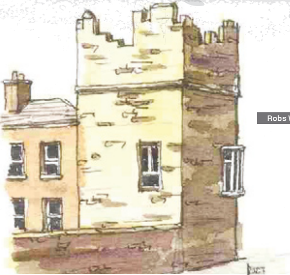
Robs Wall Castle