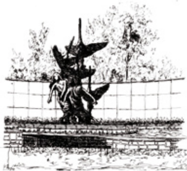
Garden of Remembrance