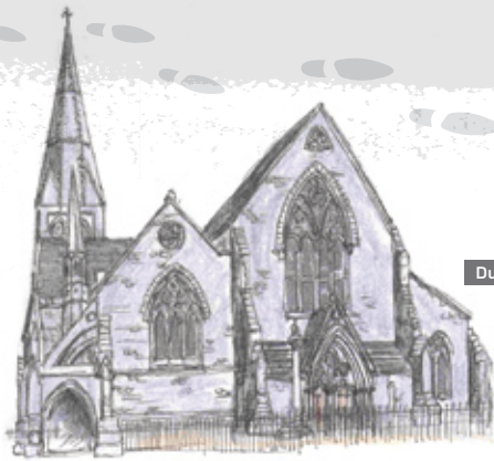
Dublin Tourism Centre