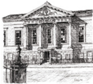
The Gate Theatre