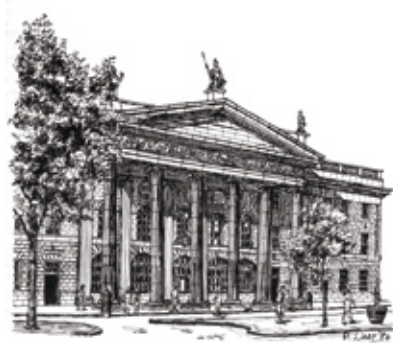
General Post Office

Looking across at the GPO it is hard to believe that this splendid building was once just a smouldering ruin after it was reduced to virtual rubble in the rebellion of 1916. In 1917 a link between the GAA ( Gaelic Athletics Association ) and the 1916 Rebellion was created when the rubble from O'Connell Street and the GPO was brought to Croke Park. It was used to create a mound at the northern railway end of the stadium for viewing purposes. This mound affectionately became known as Hill 16. When the stadium was redeveloped this was renamed Dineen Hill 16 and remains a terrace for spectators.